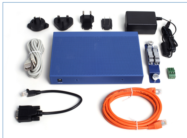
UTM-1 Edge N Industrial Package Components